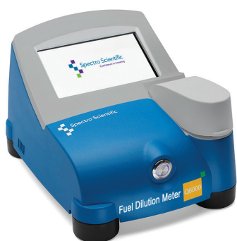
Figure 1: Q6000 Fuel Dilution Meter

The Q6000 FDM is a portable, battery operated fuel dilution meter that determines the concentration of fuel dilution present in an oil sample within a matter of minutes (Figure 1). The Q6000 FDM uses a unique patent pending fang design to pierce the cap of a disposable sample vial and draws in the headspace from the vial. The headspace flows over a SAW (Surface Acoustic Wave) sensor which reacts specifically to the presence of fuel vapor with a detection range of 0 – 15%