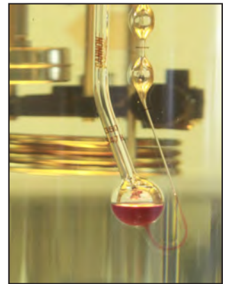
A viscometer is used in a laboratory to measure a hydraulic fluid's viscosity. (resistance to flow).