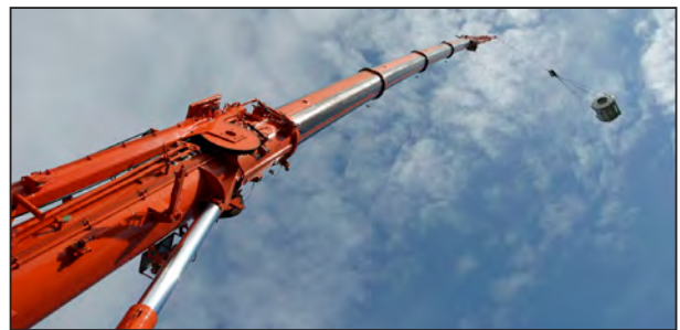
Top: A crane is an example of equipment that uses mobile hydraulic fluid.

Fluids that are marketed as environmentally friendly means the ingredients are either biodegradable, low-toxicity, bio-based, recyclable, or combinations of all of these.