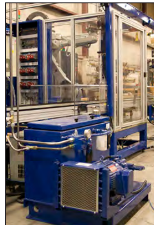
Left: Machines such as this one on a factory floor use industrial hydraulic fluid.