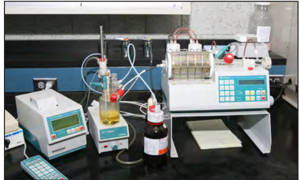
The Karl Fisher titrator is the most accurate laboratory test for measuring the amount of water contamination in hydraulic oil.

Water contamination of hydraulic oil may result in metal corrosion, bearing wear, and fluid oxidation. Fluid oxidation reduces the fluid's lifetime by as much as 70 percent, and it affects component operation. [24] One common source of water contamination is ingress through the reservoir's breather pipe. Generally, water concentrations should not exceed 200-300 ppm. [24] The test of choice for evaluating water in hydraulic fluids is the Karl Fischer method.