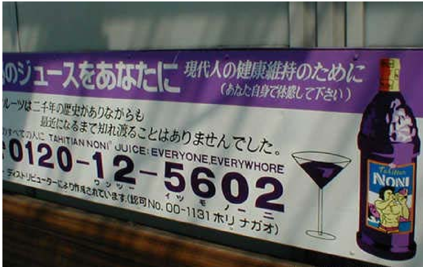
And I thought Noni juice was healthy....