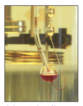
A viscometer is used in a laboratory to measure a hydraulic fluid's viscosity. (resistance to flow).