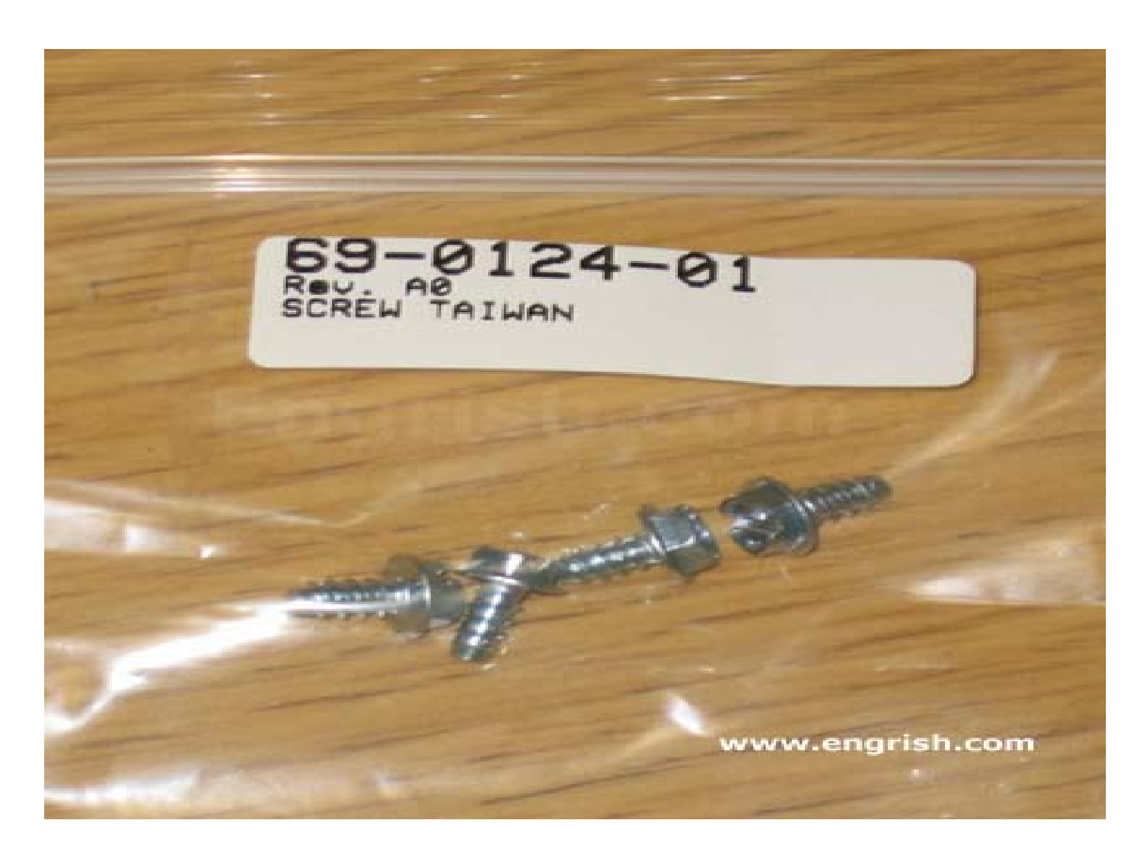
Made in China