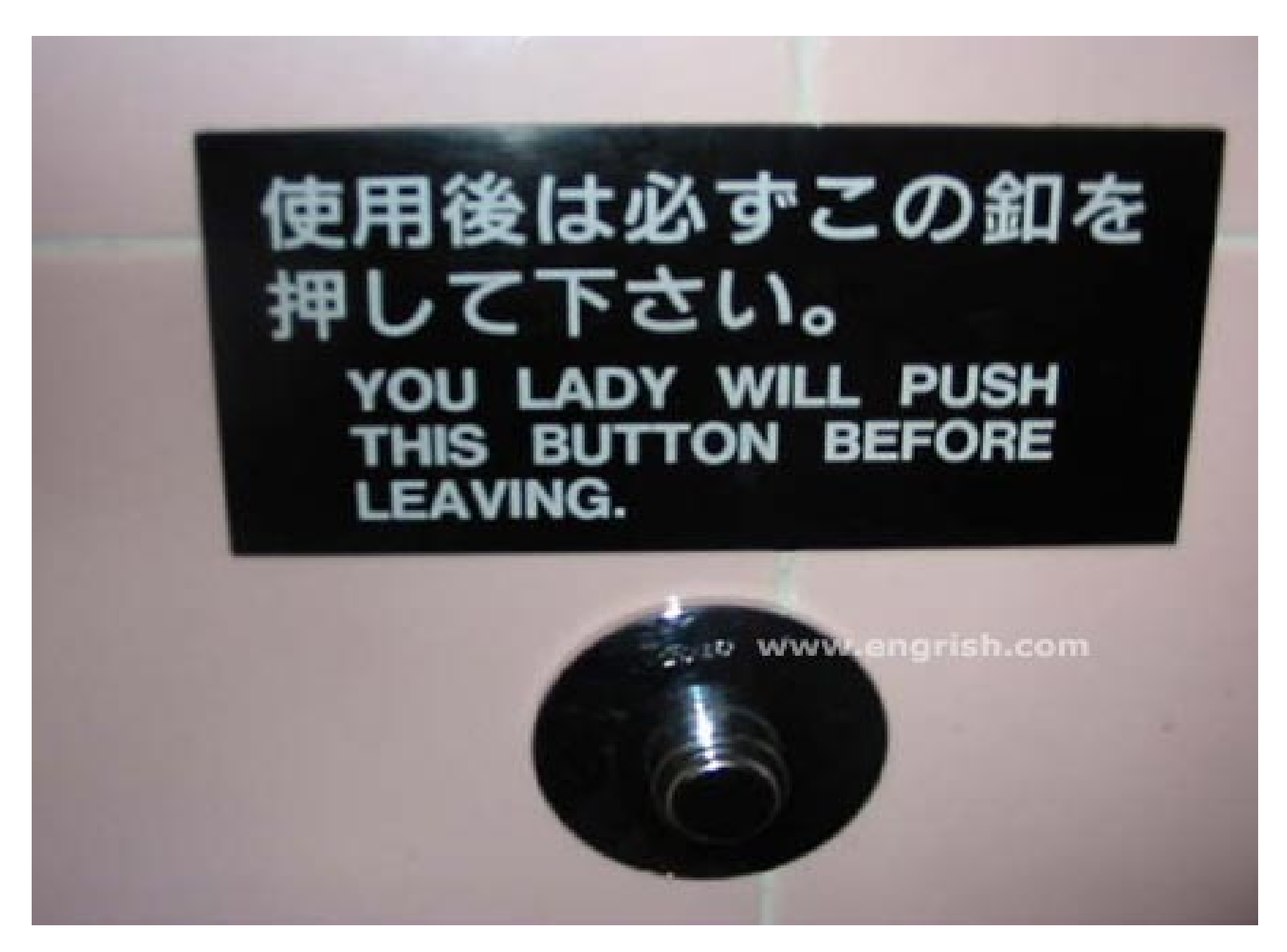
Ahh...just like any lady does....