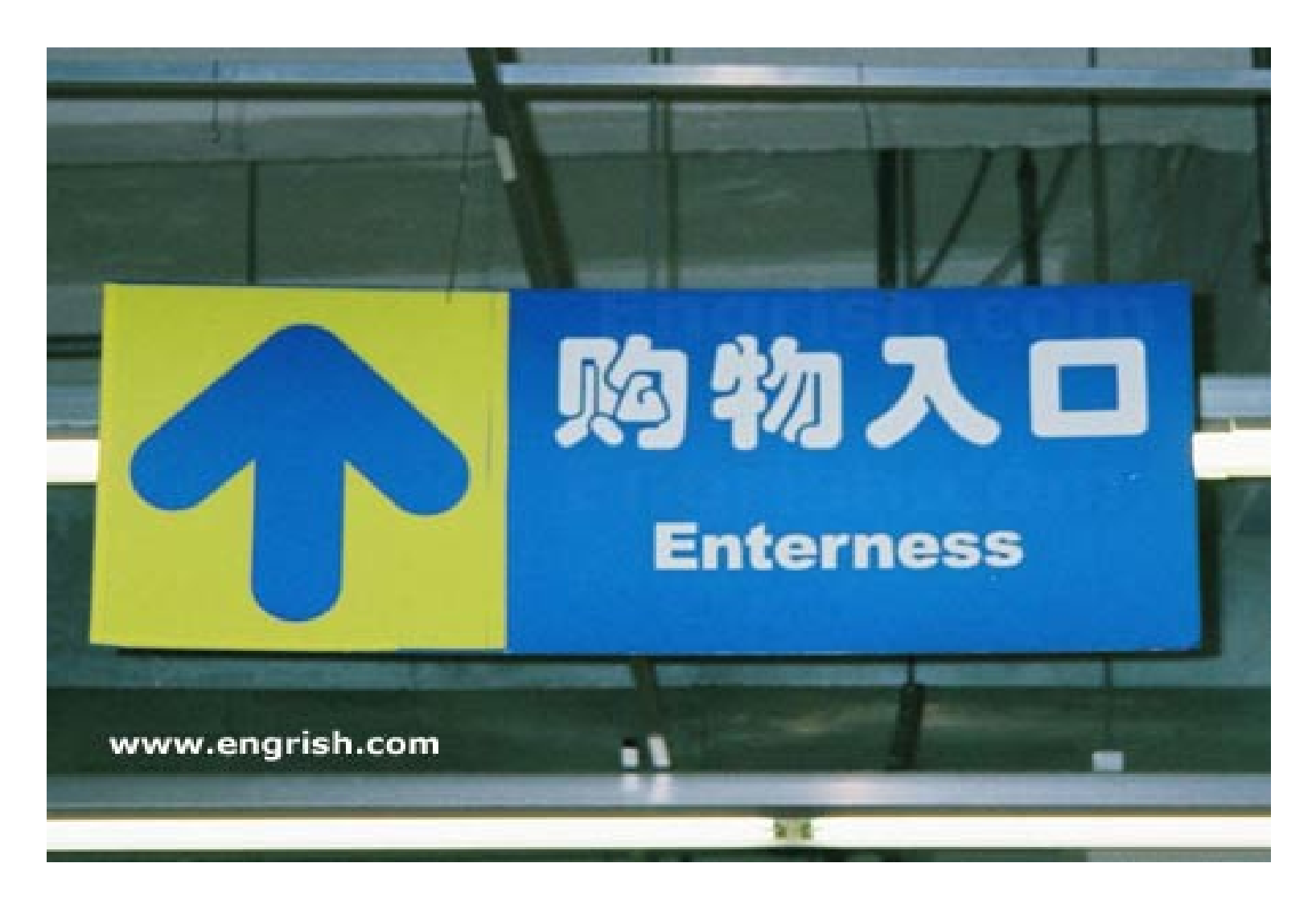
The art of entering...