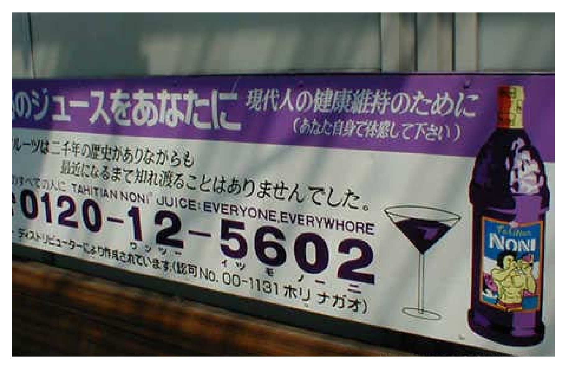
And I thought Noni juice was healthy....