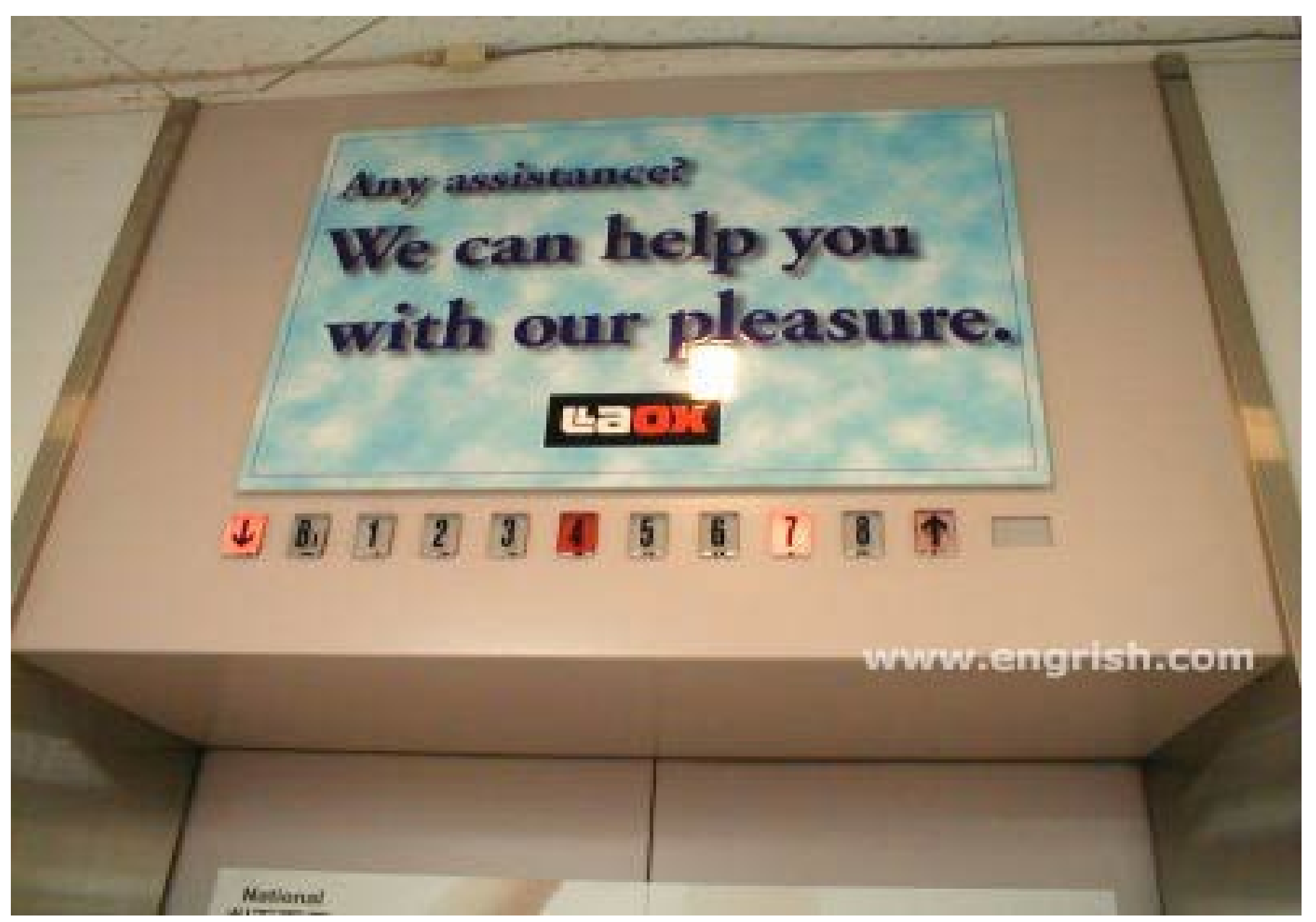
Who doesn't like that? Right, Men?