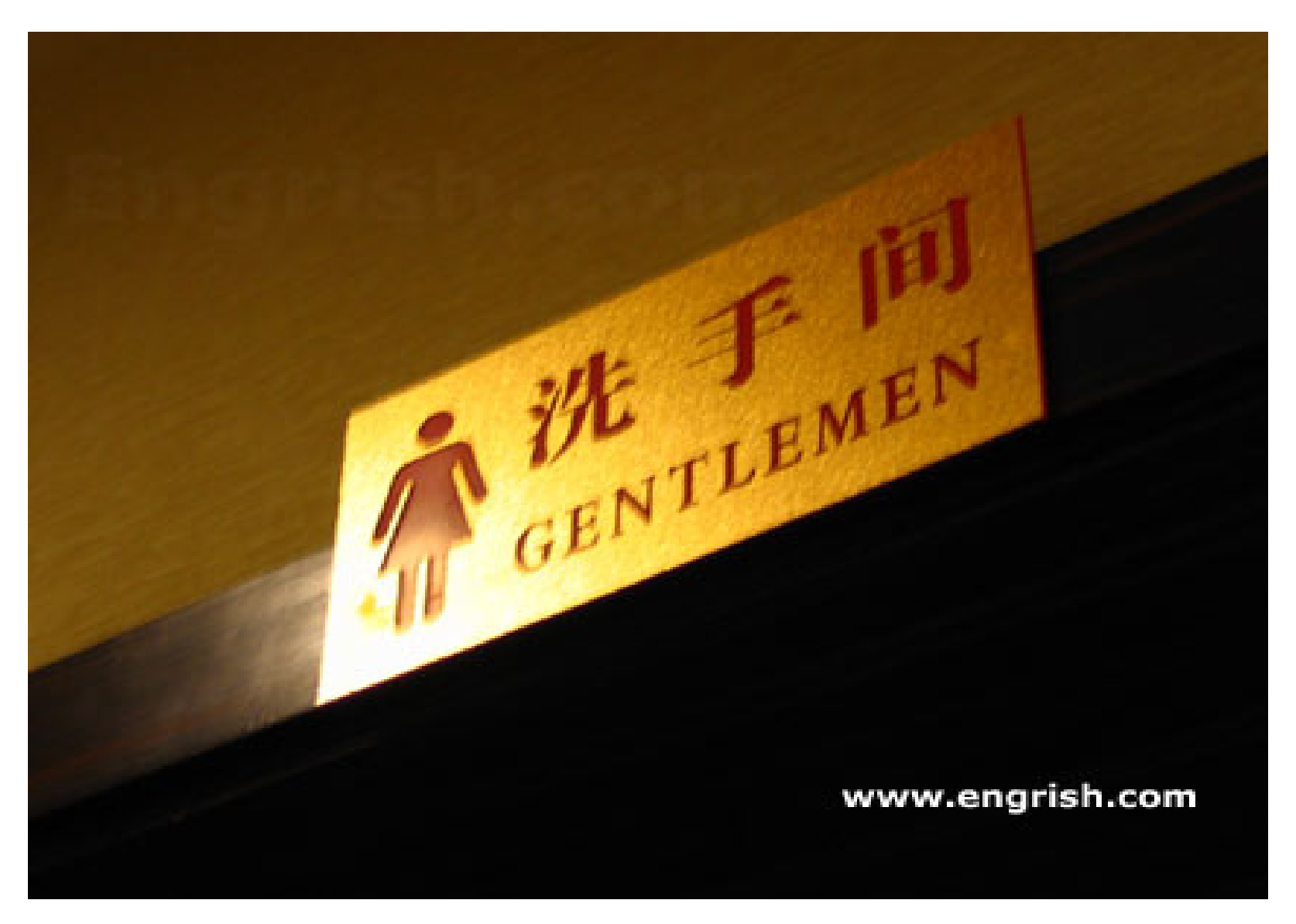
Damn those feminists!