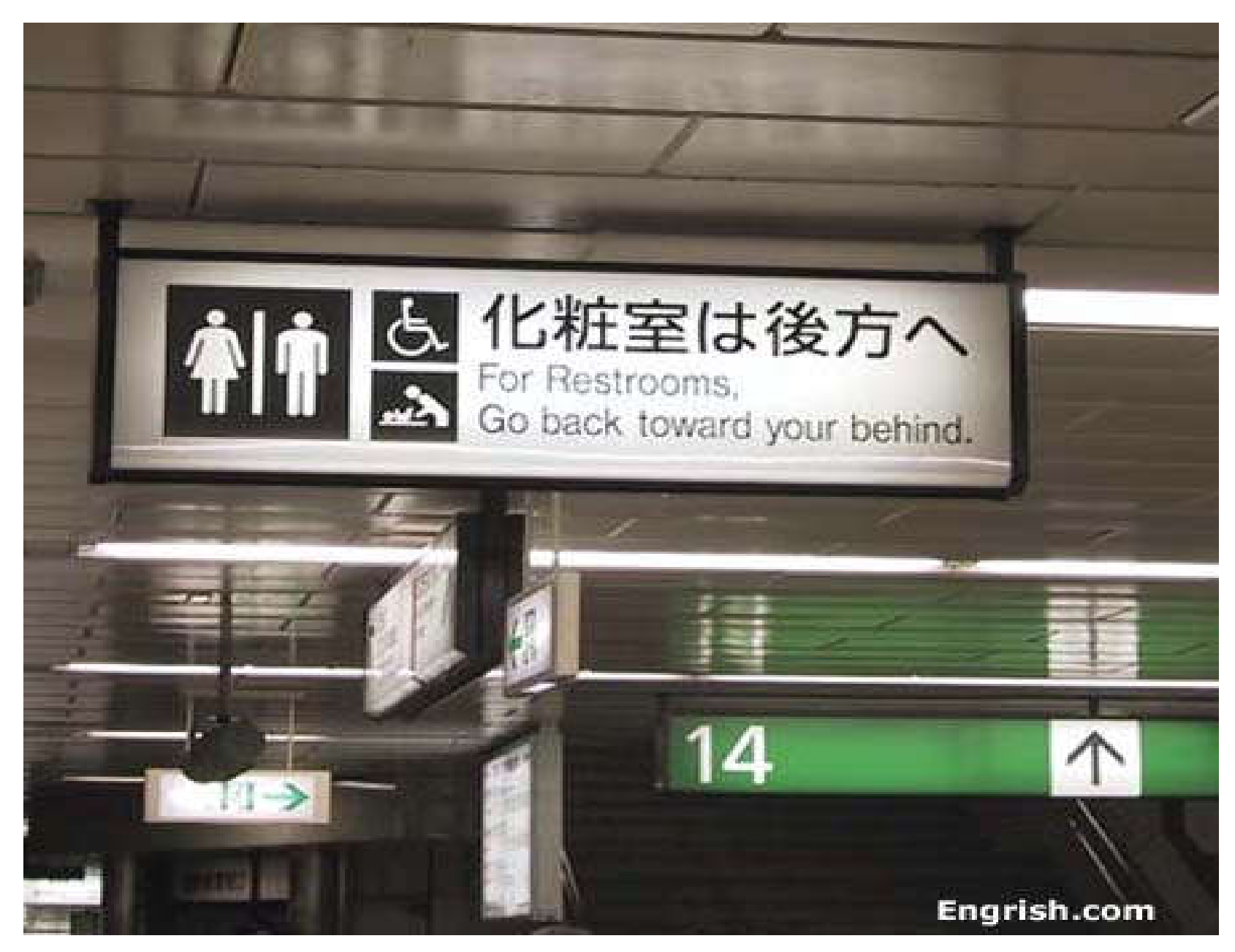
Good luck finding them restrooms.