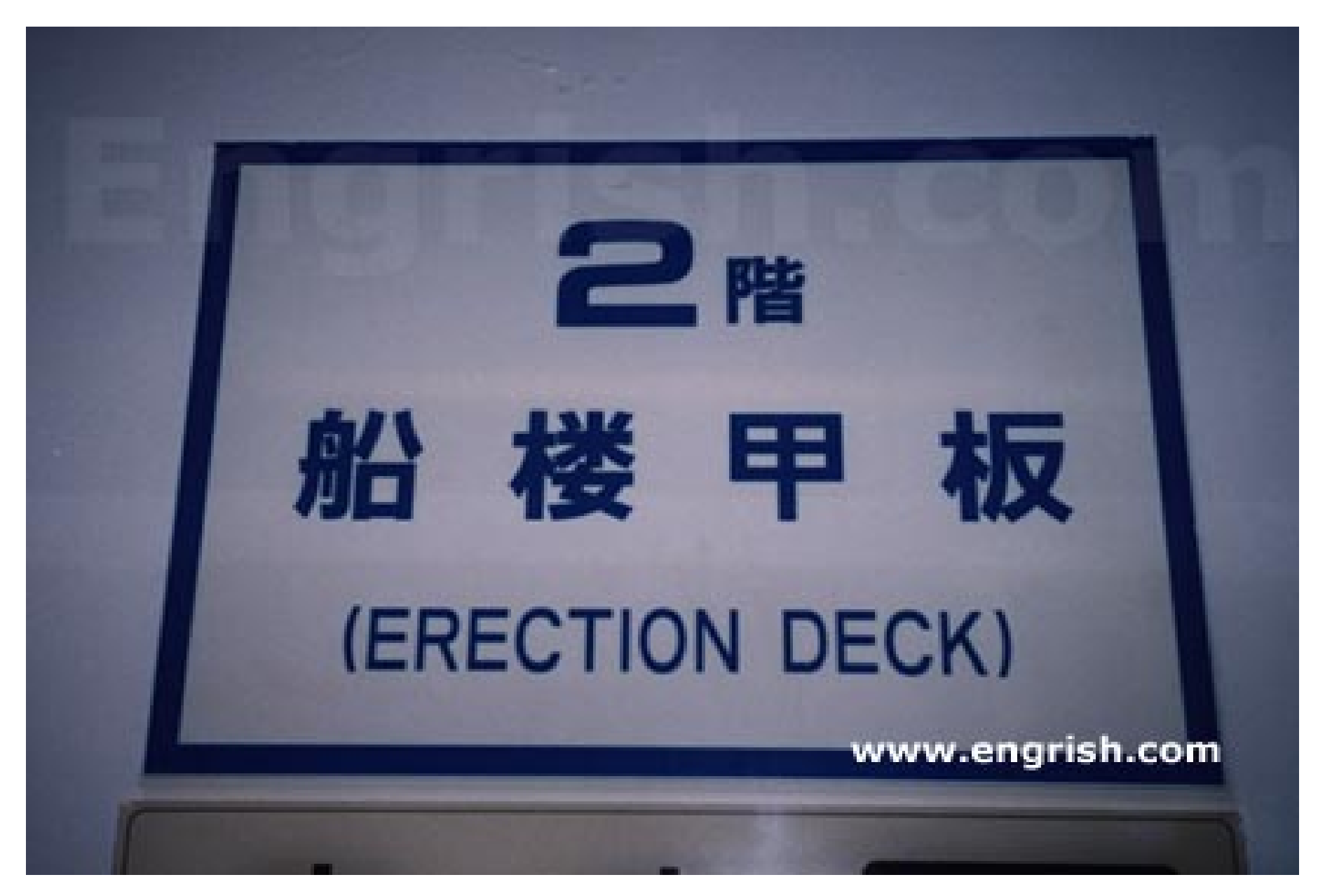
What a deck!