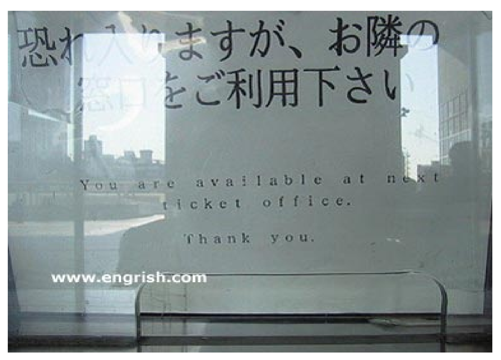
Yes, ..... You -