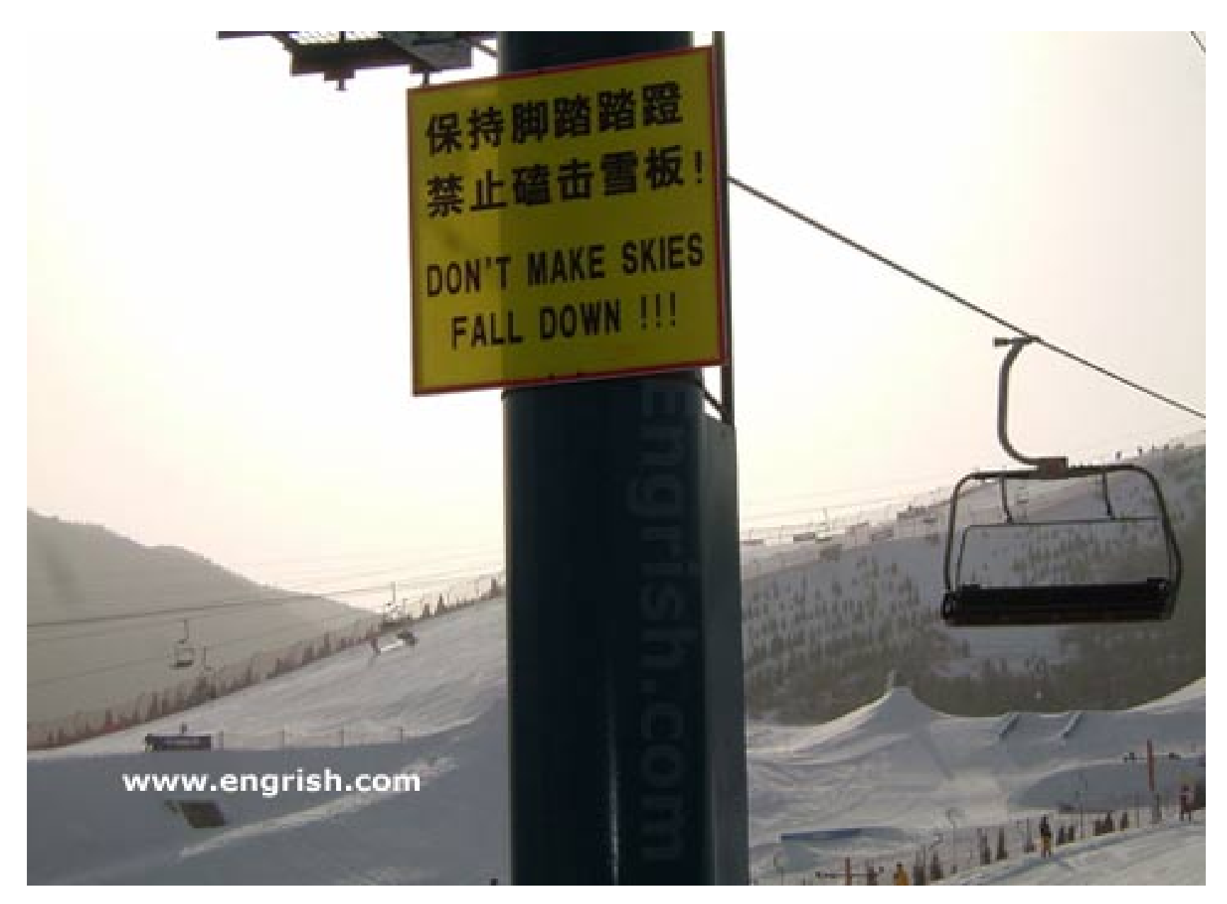
But you can always try!!!