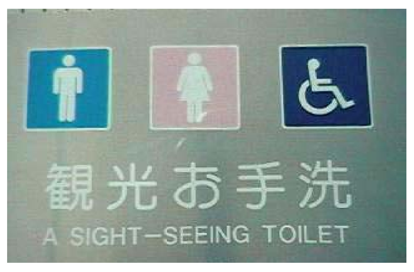
Entrance is absolutely free!